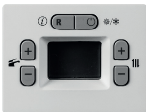
Boiler control panel

This new and modern design and the compact dimensions of the whole range makes RinNova Premium suitable to be installed in any environment.