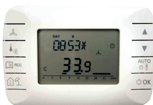
Base remote control

Display of fault diagnostics, lockout conditions and fault log