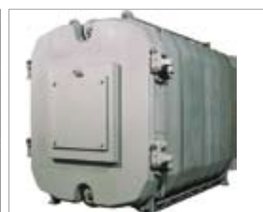
TOP TECHNOLOGY BY DESIGN