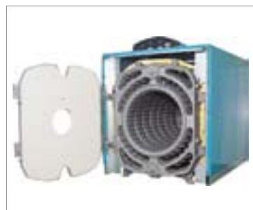
ROBUST AND DURABLE QUALITY