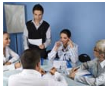
FOR MAXIMUM CONFORT AND EFFICIENCY