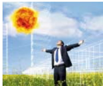
WARMTH AT YOUR FINGERTIPS